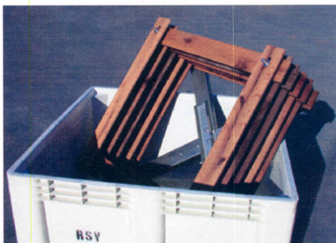
A snap to assemble and at only 25 pounds, the Binsert™ is quick and easy to install.

Thereafter, you nest the Binsert into the macrobin, fill it with must, cover it with a tarp and secure it with bungee cords. Done.